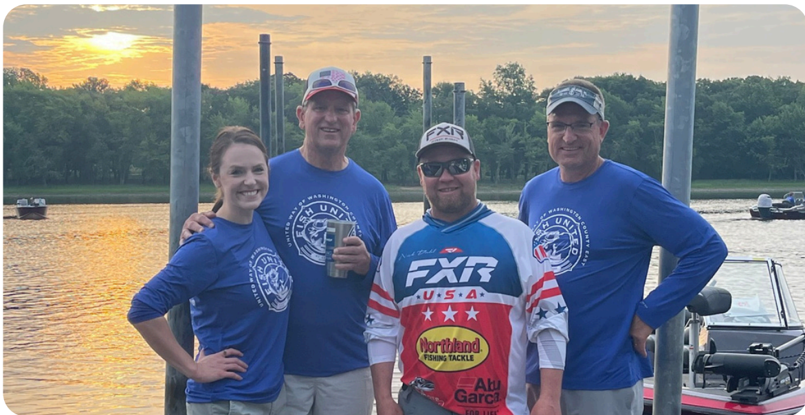
FISH United 2023